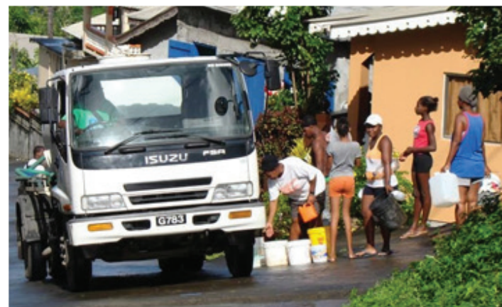
Figure 1 - A female householder carrying water and several queued up to receive water from a utility water lorry (left) during the 2009-2010 drought in St. Vincent.