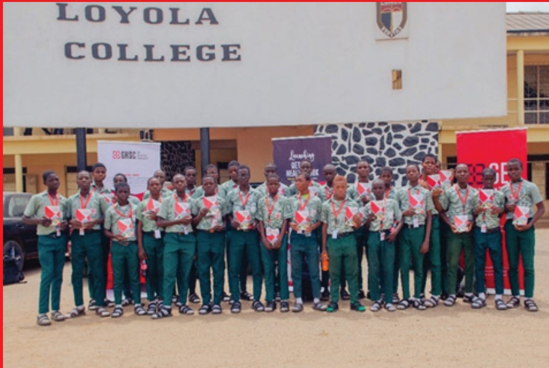
Loyola College GHSP Ambassadors in a group photograph