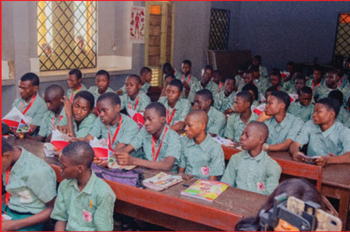
The students well seated at the event