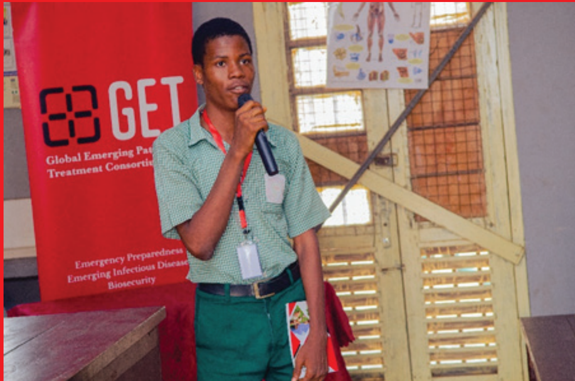
The School Prefect talking about what he learnt and giving vote of thanks