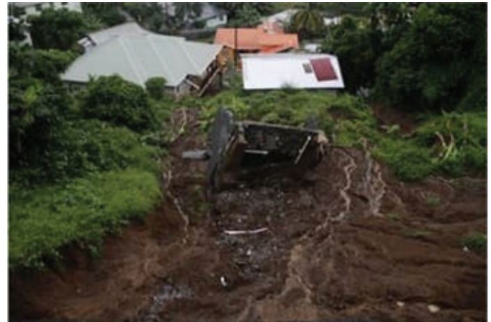
Figure 2 - Post-drought landslide in Dominica (l) and St. Vincent (r) after the return of the rains. Source: Farrell and Trotman (2010) and Kenton Chance (2016).