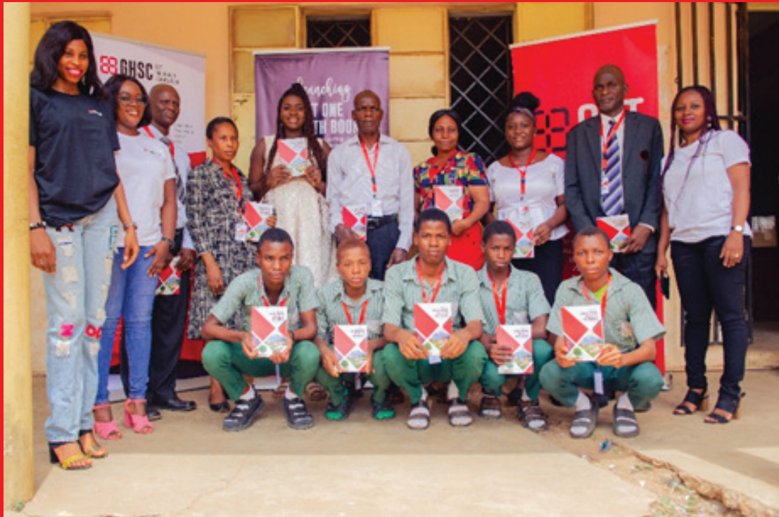
GET Staff and Loyola College Staff with some of the GHSP Ambassadors