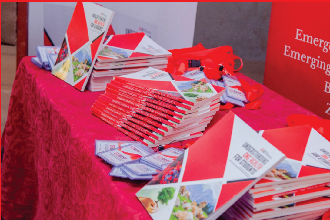
Display of GET Book on One Health during the event