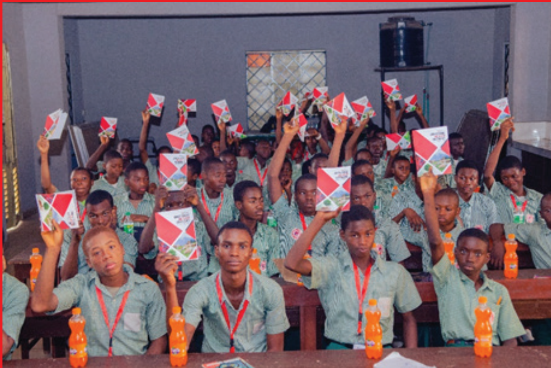
The Ambassadors showcasing their free GHSP textbooks on One Health